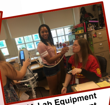
CNA Lab Equipment Departmental Grant