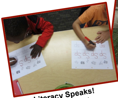
Literacy Speaks! District Grant

"You make a difference in the lives of thousands of children for years to come, thanks for your support" - a Rock Island-Milan Teacher