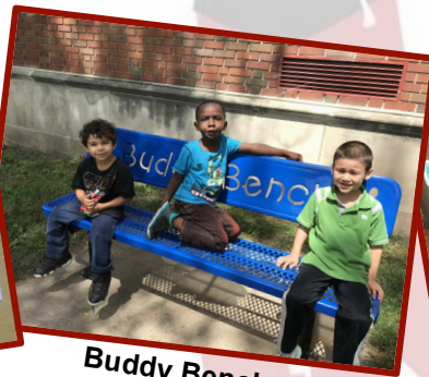
Buddy Bench Teacher Grant