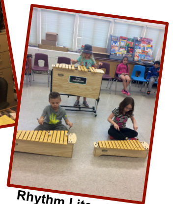
Rhythm Literature Teacher Grant